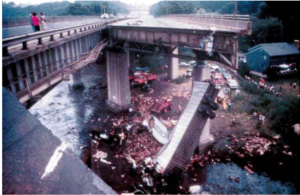
Figure 1.2.1 Mianus Bridge Failure

Protect Public Investment Another responsibility is to protect public investment in bridges. Be on guard for minor problems that can be corrected before they lead to costly major repairs. Also, be able to recognize bridge elements that need repair in order to maintain bridge safety and avoid replacement costs.