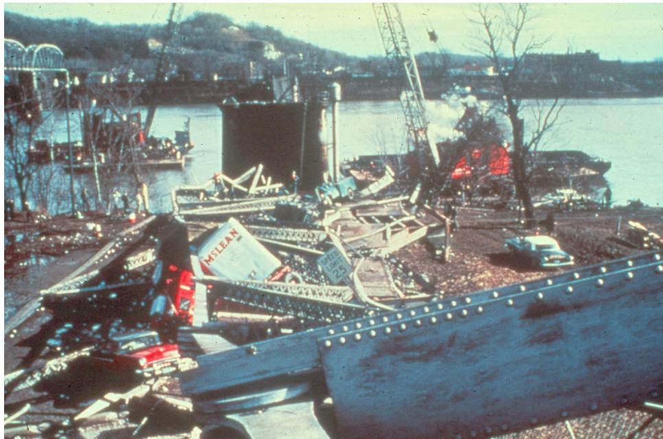
Figure 1.1.2 Collapse of the Silver Bridge

During the bridge construction boom of the 1950's and 1960's, little emphasis was placed on safety inspection and maintenance of bridges. This changed when the 2,235-foot Silver Bridge, at Point Pleasant, West Virginia, collapsed into the Ohio River on December 15, 1967, killing 46 people (see Figure 1.1.2).